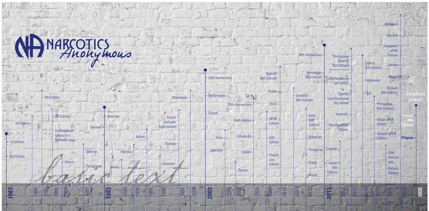
2020 Basic Text Timeline

In the end, this isn't about politics or personal views; this is about the spiritual principles of group conscience and NA unity. Please respect the will of the fellowship. Illicit literature has no place in our meetings. For more information about NA's copyrights and world services' responsibility to protect them, see www.na.org/fipt .